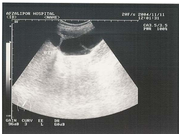
Figure 1. Hyperstimulated ovary with multiple large cysts.