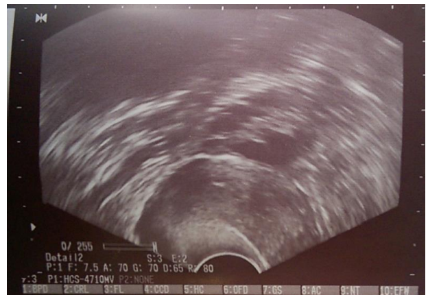
Figure 1. Sonography before induction of ovulation-normal ovary without dominant follicles.

An informed consent was obtained from the patient for publication of this case report and accompanying images.