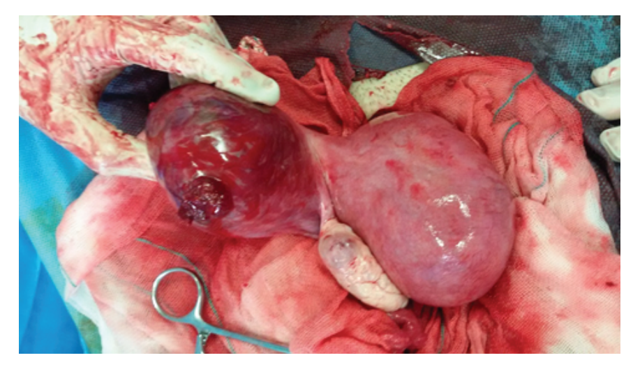
Figure 2 : Intraoperative photograph showing the posterior view of the unicornuate uterus with the rudimentary horn having a 2-cm rupture with the placenta protruding.