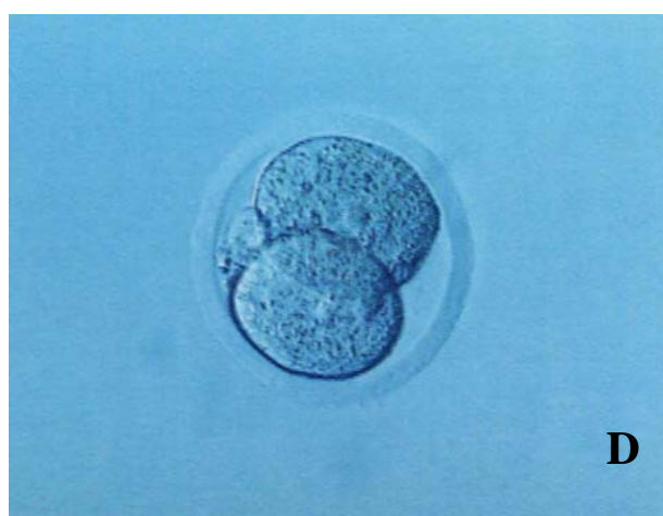
Figure I. Cryoloop and cryovial used for vitrification of oocytes(A) The loaded cryoloop(B) Injection of sperm in freez-thawed oocyte(C) 2 cell embryo 24 hours after sperm injection (D). 4 cell embryo 48 hours after sperm injection (E).