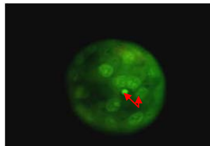
Figure 2. Fluorescent photograph of a treated blastocyst with pycnotic (long arrow) and non-pycnotic cells (short arrow).