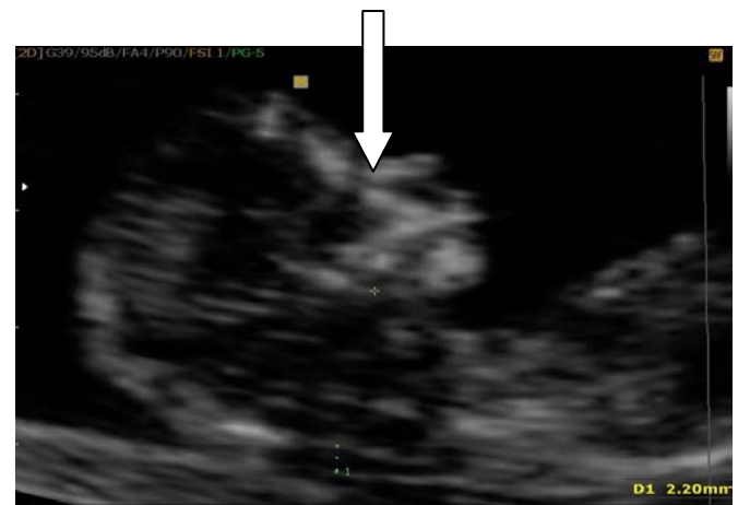
Figure 1. Nasal bone in sagittal view

Factors for maternal age and NT, and fetal heart rate (FHR) and serum free BHCG and PAPP-A were used in this screening; based on these factors and the cut of risk 1 in 100, false positive rate was 3%, if the nasal bones factor added to screening, the false positive rate was declined to 2.5%. Another study in 2003 by Bunduki et al was conducted in São Paulo university in Brazil where 1,631 women over 35 years at 16-24 weeks of pregnancy of gestation were examined and the length of the nasal bones less than fifth percentile of the population was identified as the cut of risk. 1631 singleton pregnancy cases and mothers over 35 years were investigated in this study and a linear relationship was discovered between the presence or absence of the nasal bone and Down's syndrome (Figure 1) (7). This study has been planned to evaluate the importance of fetal nasal bone in the diagnosis of choromosomal abnormalities in khuzestan province.