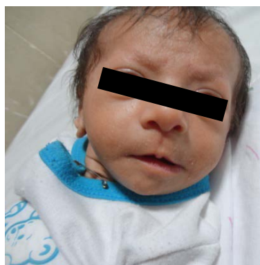
Figure 1. Facial dysmorphism, ocular hypertelorism in the patient.

The patient was follow up at the age of 9 months. He had 5.5 kg weight, 63 cm height and 40 cm head circumference, that total were <5 th percentile. He had developmental delay and hypotonia so he could not sit. Genital abnormalities comprise microphallus and right undescendent testis were seen in the patient (Figure 4).