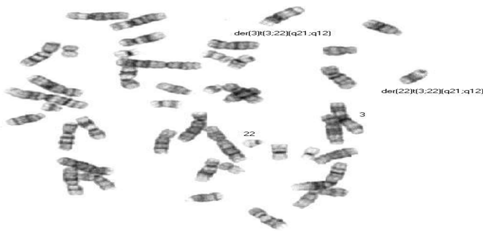
Figure.1: The karyotype of proband showing 46, XX, t (3;22)(q21;12).

The family pedigree was prepared according to Rimoin et al. (6). The known karyotypes of the family members were: the proband 46,XX,t(3;22); proband's husband 46,XY; proband's mother 46,XX,t(3;22); proband's father 46,XY; and the proband's daughter 46,XX,t(3;22), proband's aunt and cousin 46,XX,t(3;22), and cousin of proband's mother 46,XX,t(3;22) . Other family members either were not cooperated or were not available to participate in cytogenetic examinations (Figure 2).