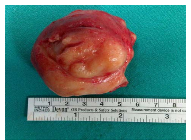
Figure 2. Dimension of myoma.

After clamping the peduncle, 5×6 cm mass was removed. Vaginal defect was repaired with absorbable 2/0 polyglactin 910. Histopathologic evaluation confirmed leiomyoma with degeneration and inflammation (Figure 2). The postoperative course was uneventful and she was discharged without any complication on the second postoperative day. Postoperative ultrasonographic examination revealed a normal pelvic texture.