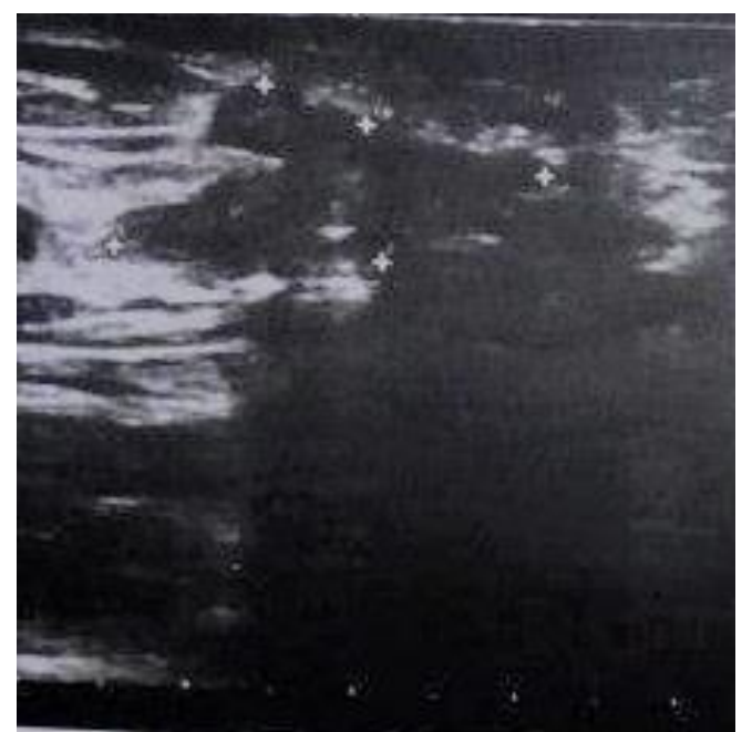
Figure 2. Ultrasonography image shows a 26x12x25mm vascularized, hypoechoic, irregular in shape lesion in the abdominal wall, 7mm deep to the skin.