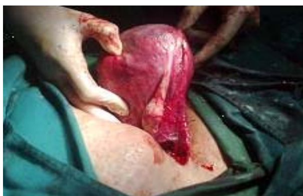
Figure 4. Normal right adnexa without any adhesion or hydrosalpinx is seen during cesarean section.