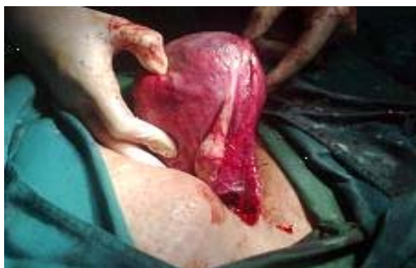
Figure 4. Normal right adnexa without any adhesion or hydrosalpinx is seen during cesarean section.