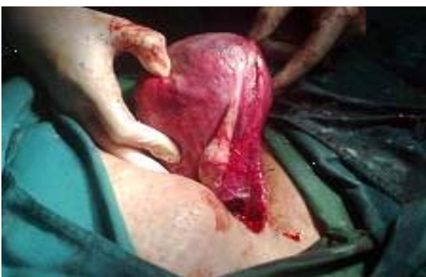
Figure 4. Normal right adnexa without any adhesion or hydrosalpinx is seen during cesarean section.