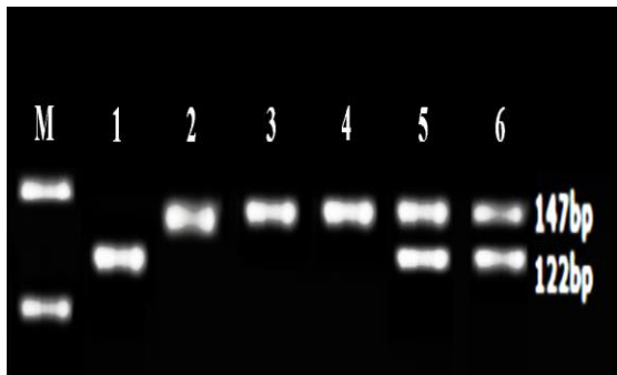
Figure 2. The enzyme digestion pattern of rs2910164. M is 50-bp size marker; Lane 1 is wild-type homozygous alleles (C/C); Lane 2, 3 and 4 are mutant type homozygous alleles (G/G); Lane 5 and 6 are heterozygous alleles (C/G).