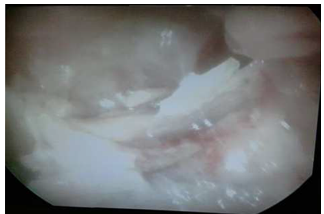
Figure 2. Multiple retained fetal bones in the uterus.