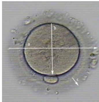
Figure 2. Dimintions that were measured during mormorphometry evaluation of oocytes after IVM.