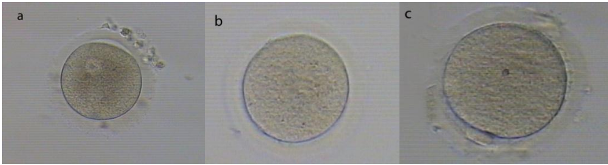
Figure 1. Morphological markers characterizing the meiotic status of human oocytes.