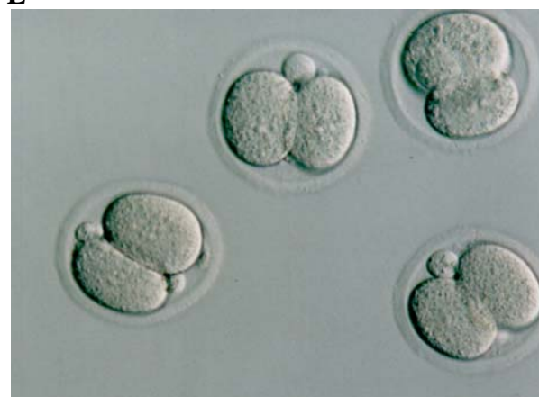
Figure 3D&E. Completion of the second meiotic division (MII) after 24h culture. (D). A fertilized 2-pronuclear zygote (E). A cleaved embryo at 24h post fertilization. All pictures taken under Hoffman contrast optics. Original magnification: ×320: B×200. Bar=32 μm.