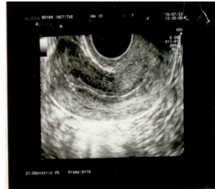
Figure 3 (A, B, C). Case 3. A) HSG 4 years ago, bilateral tubal obstruction with golf-club appearance, B) Recent HSG revealed T shaped uterus, Venous and lymphatic intravasation. C) Uterine ultrasound, tiny foci of calcification within the endometrium which shows some degree of adhesion.