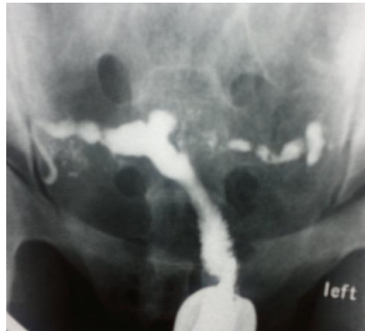
Figure 2. Case 2: Irregular uterine cavity and clover leaf appearance. Irregular border and beaded appearance in both fallopian tubes