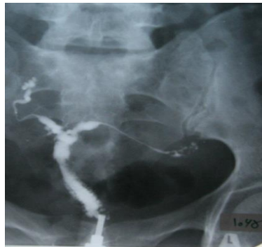
Figure 6. Small uterine cavity with irregular contour and resembling septate appearance. Diverticular outpouching around ampulla in both fallopian tubes which make tuffed appearance.