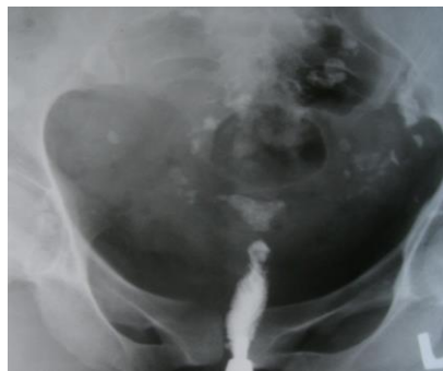
Figure 4. Case 4: Small uterine cavity and linear streaks of calcification in the course of the fallopian tube (Tubal calcification).