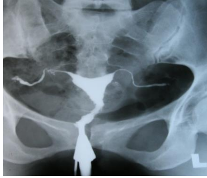
Figure 1. Case1: Uterine cavity with normal shape and size. Also there is rigid pipe stem appearance of the fallopian tubes