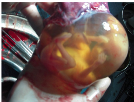
Figure 2. Intact foetus inside the rudimentary horn which was excised.