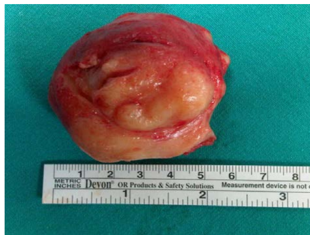
Figure 2. Dimension of myoma.