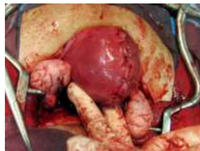
Figure 2. After reconstruction of the uterus (1500×1125)