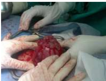
Figure 1. Vesicular mass in fundus of the uterus (480×360)