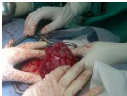
Figure 1. Vesicular mass in fundus of the uterus (480×360)