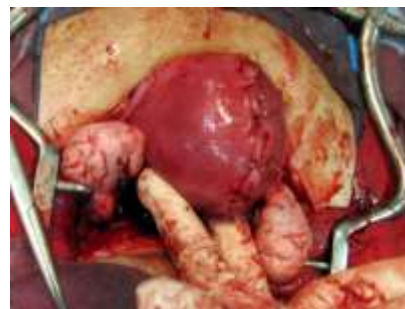
Figure 2. After reconstruction of the uterus (1500×1125)