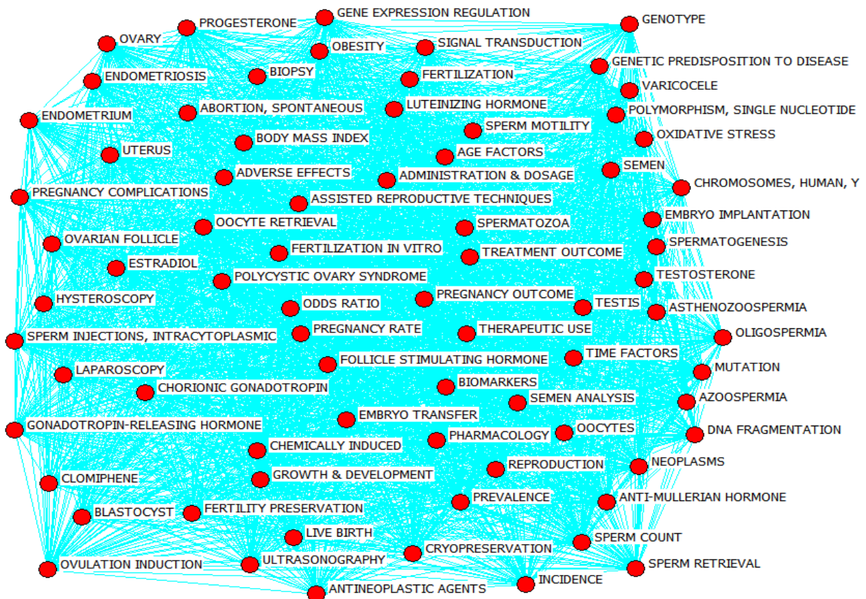
Figure 3. General overview of co-occurrence infertility words network over the period 2011-2015.