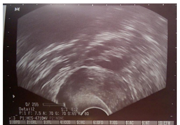
Figure 1. Sonography before induction of ovulation-normal ovary without dominant foliculs.

An informed consent was obtained from the patient for publication of this case report and accompanying images.