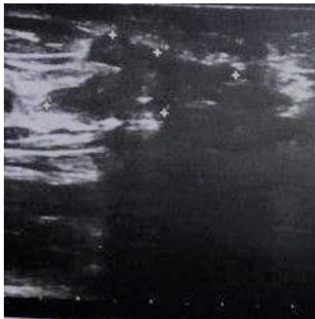
Figure 2. Ultrasonography image shows a 26x12x25mm vascularized, hypoechoic, irregular in shape lesion in the abdominal wall, 7mm deep to the skin.