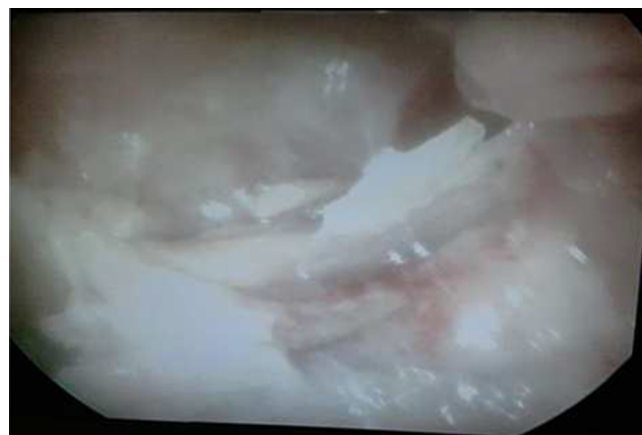
Figure 2. Multiple retained fetal bones in the uterus.