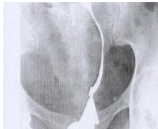
B- Lateroversion of the uterus