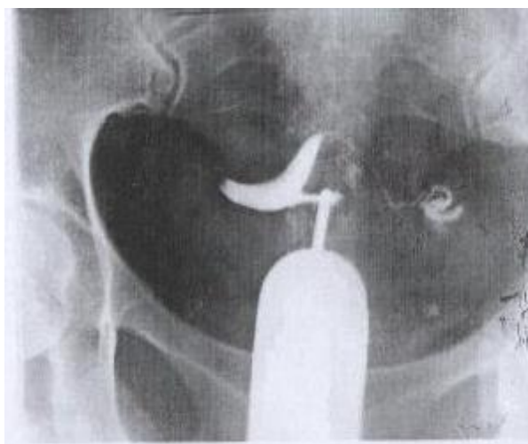
Figure 3. Hystero salpingography of the case after the procedure; tubes are patent and the inferior segment of the uterus is no longer elongated.