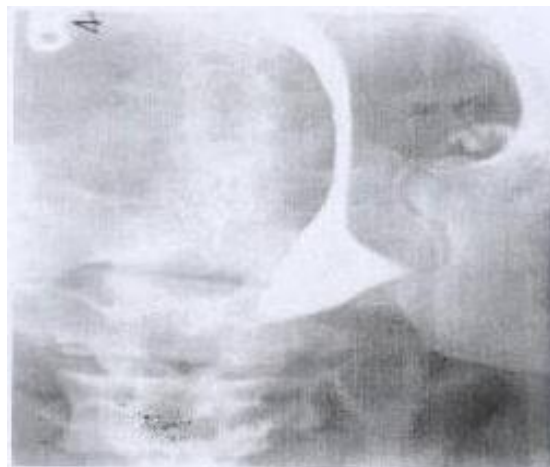
C- Obstruction of the Left tube