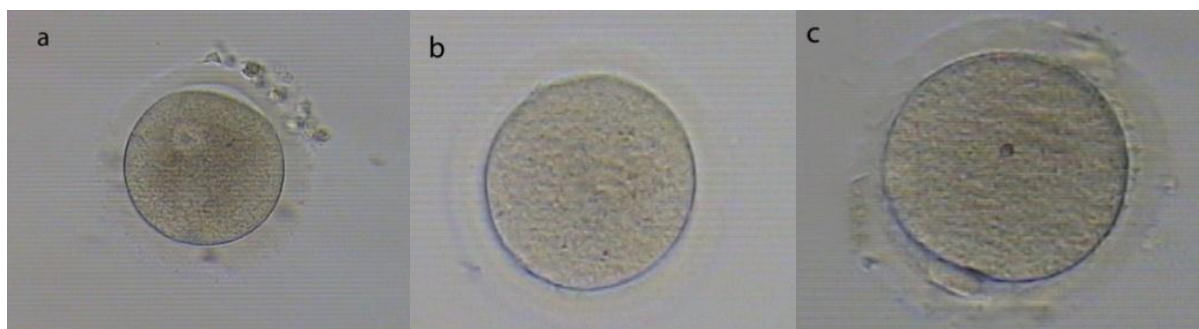
Figure 1. Morphological markers characterizing the meiotic status of human oocytes.