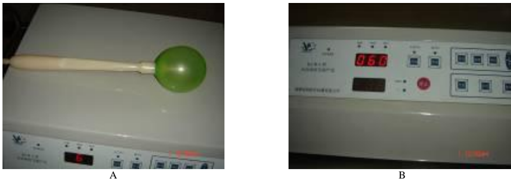
Figure 1. Illustration of the air bag bionic midwifery instrument. (A) Latex gasbag; (B) Control panel.

The data were analyzed using SPSS (version 12.0, SPSS Inc., USA). Student's T-test and Chi-square test were used for data analysis.