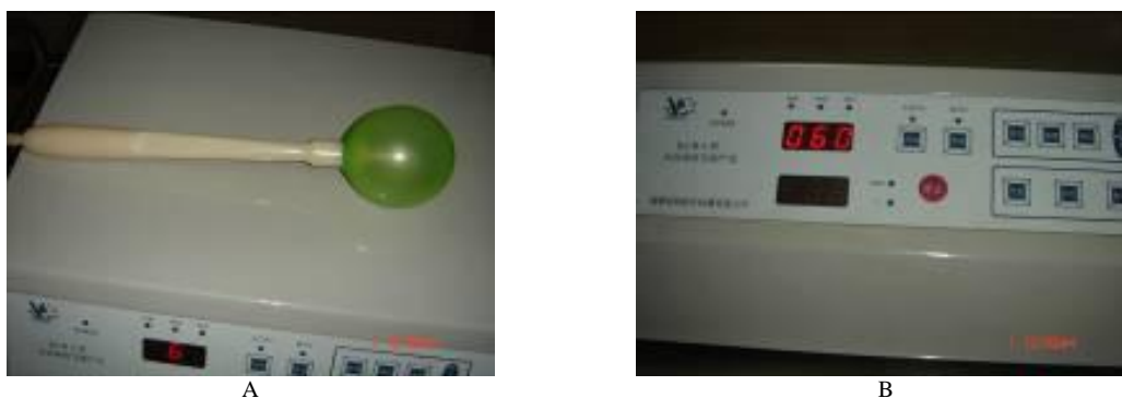
Figure 1. Illustration of the air bag bionic midwifery instrument. (A) Latex gasbag; (B) Control panel.

The data were analyzed using SPSS (version 12.0, SPSS Inc., USA). Student's T-test and Chi-square test were used for data analysis.