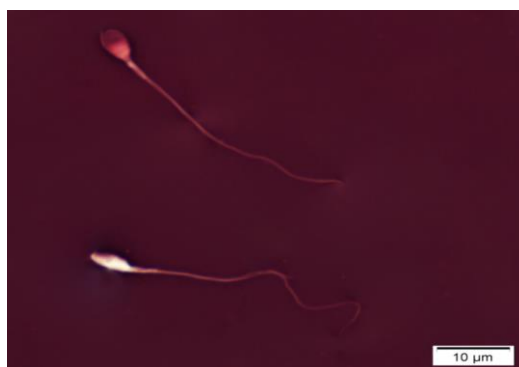
Figure 1. Evaluation of human sperm viability using eosin-nigrosin staining. a: unstained (white) is alive spermatozoon, b: stained (red) spermatozoon is dead.

#: Statistical analysis using Fisher's exact test