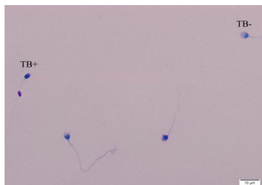
Figure 4. Toluidine blue staining method for sperm morphological evaluation. Light blue sperm heads show normal DNA and dark blue sperm heads show damage to DNA.