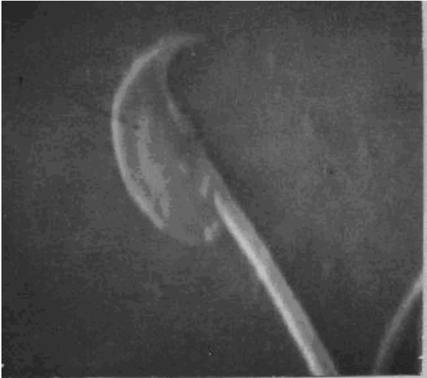
Figure 1. SEM photograph cauda epididymis sperm of normal fertile, adult mouse showing the scimitar shaped head. X 2750