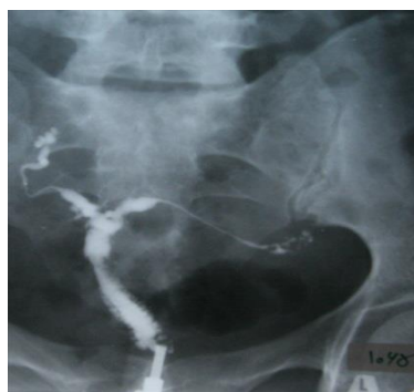
Figure 6. Small uterine cavity with irregular contour and resembling septate appearance. Diverticular outpouching around ampulla in both fallopian tubes which make tufted appearance.