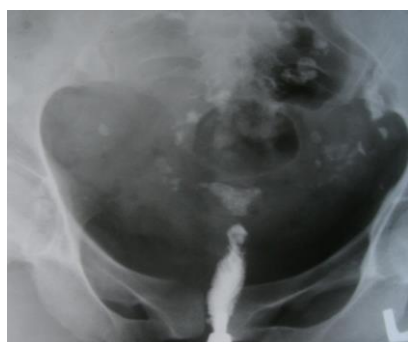
Figure 4. Case 4: Small uterine cavity and linear streaks of calcification in the course of the fallopian tube (Tubal calcification).