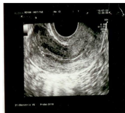
Figure 3 (A, B, C). Case 3. A) HSG 4 years ago, bilateral tubal obstruction with golf-club appearance, B) Recent HSG revealed T shaped uterus, Venous and lymphatic intravasation. C) Uterine ultrasound, tiny foci of calcification within the endometrium which shows some degree of adhesion.