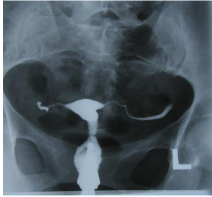
Figure 5. Occlusion in both distal isthmic region of fallopian tubes with pipe stem appearance.