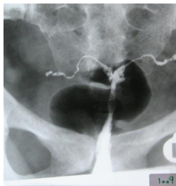
Figure 8. Small size of uterine cavity with irregular contour and septate appearance. Obstruction in distal isthmic portion of both tubes and golf club appearance.