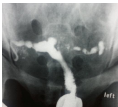
Figure 2. Case 2: Irregular uterine cavity and clover leaf appearance. Irregular border and beaded appearance in both fallopian tubes