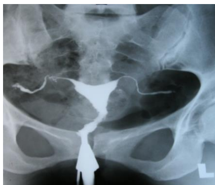
Figure 1. Case1: Uterine cavity with normal shape and size. Also there is rigid pipe stem appearance of the fallopian tubes