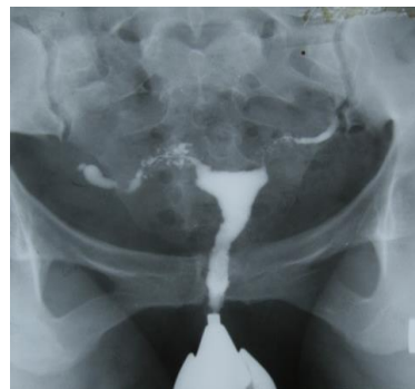
Figure 7. Normal shape of uterine cavity, irregular contour and diverticular outpouching which surround isthmus of right fallopian tube and make SIN appearance.