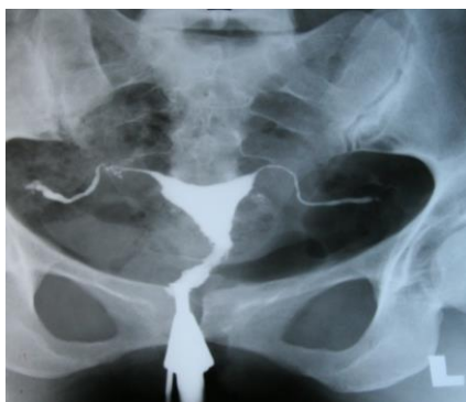
Figure 1. Case1: Uterine cavity with normal shape and size. Also there is rigid pipe stem appearance of the fallopian tubes