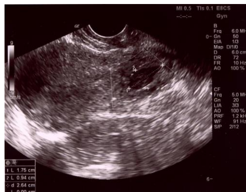
Figure 1. Ultrasonic picture of cervical pregnancy .

Monopolar rollerball was used to make hemostasis and Fibrillar net was placed in cervical canal to secure hemostasis. Patient was discharged three days later with \beta HCG level of 1.7 IU/L with no further abnormal bleeding or other symptoms.