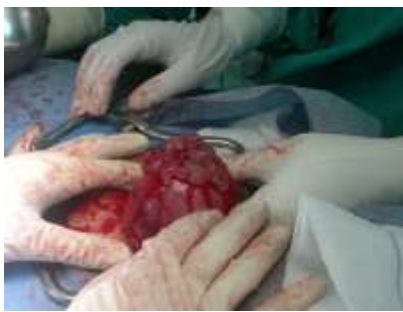
Figure 1. Vesicular mass in fundus of the uterus (480×360)