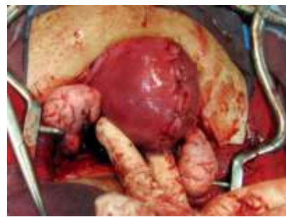
Figure 2. After reconstruction of the uterus (1500×1125)