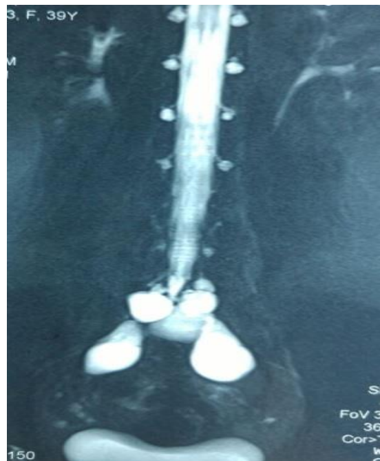
Figure 2. Magnetic resonance myelogram-Axial T1, sagittal T1 and T2 MRI of the lumbosacral region without contrast media. Perineural cyst is present inside the sacral canal at S2- S3 level.