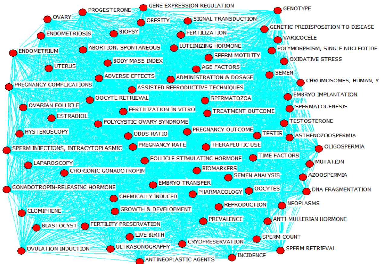
Figure 3. General overview of co-occurrence infertility words network over the period 2011-2015.